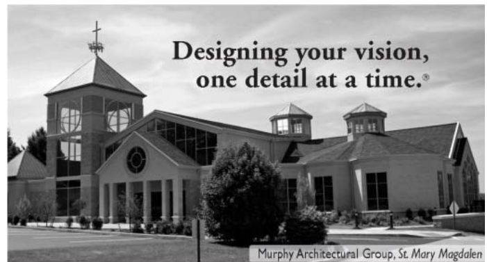
Murphy Architectural Group, St. Mary Magdalen

Phone 302-328-5019 | Fax 302-328-5067 rci1@rciplot.com | www.rciplot.com 298 Churchmans Rd, New Castle, DE 19720