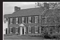
Bernardon Haber Holloway Architects, PC Kennett Twp. Municipal Bldg.