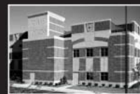
Array Healthcare Facilities Solutions Johns Hopkins