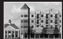
BartonPartners Architects Planners Voorhees Town Center

sustainability smart growth team building adaptive re-use