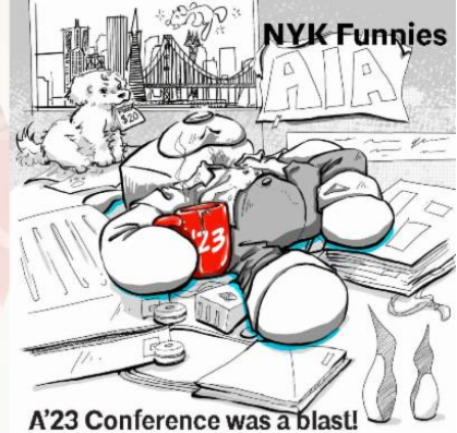
A'23 Conference was a blast!