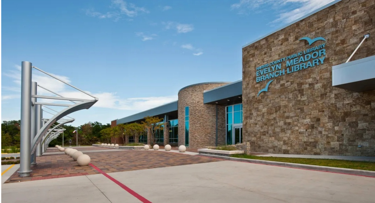
ENGLISH ARCHITECTS' EVELYN MEADOR BRANCH LIBRARY, HOUSTON'S FIRST LEED GOLD CERTIFIED LIBRARY

Practitioners in offices of 15 or fewer people usually wear many hats: chief marketer, administrator, finance officer, and principal architect. It can be overwhelming to add any more tasks to the to-do list, and even more overwhelming if you think the goal is perfection. But the 2030 Commitment is not as intimidating as you might think.